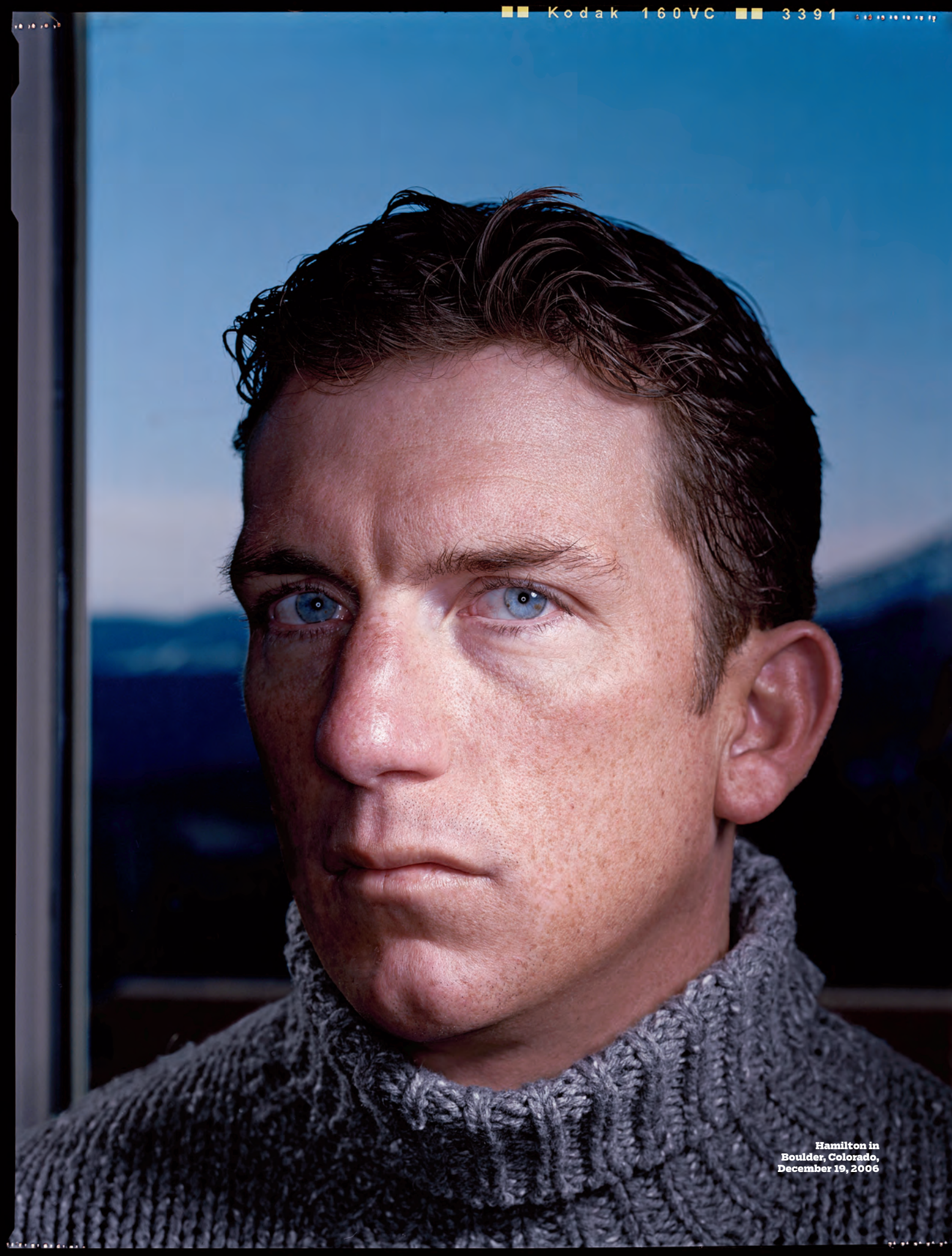
Hamilton in Boulder, Colorado, December 19, 2006